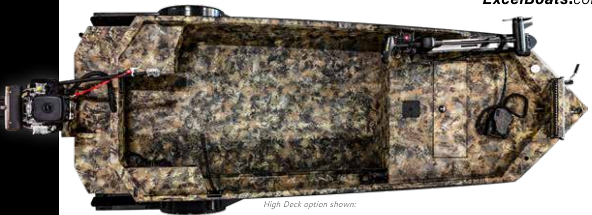
High Deck option shown: